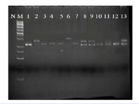
Figure 1. ITC Mutation in Flt3 Gene in Different Subgroups of Acute Leukemia Patients; N, Negative Control; M, Marker

As indicated by the marker in Figure 1, pieces 328bp are observable, which are pertinent to exon 11 and 12 and intron 11 of flt3 gene. The above samples belong to different sub-categories of FAB category and among them, column two represents AMP patients-M3; columns six and eight represent Early pre B cell patient with mutation; column nine represents patient with AML-M2; and column 13 represents AML-M1 patient. In