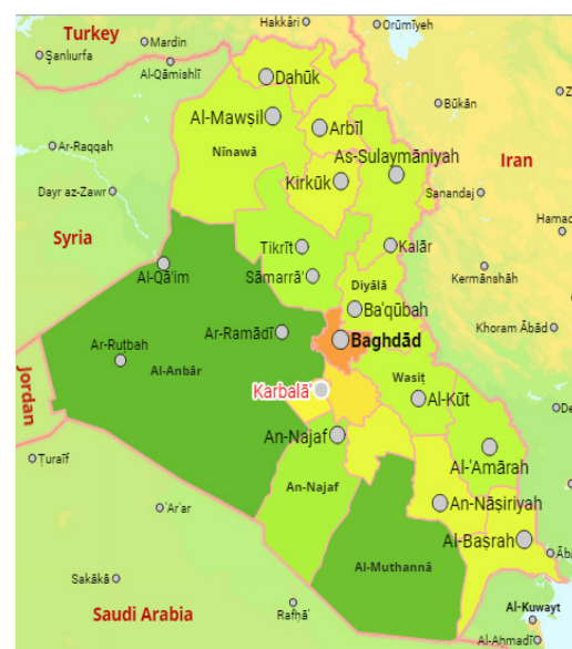
Figure 1. Map of Iraq3

In our study ALL was the more prevalent type among the studied group; contributed 41%, followed by CML 24.1%, AML 19.2% and the less frequent type was CLL which contributed only 15.7%. In study done in Sulaymaniyah province of Iraq ALL was the most