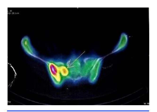
Figure 1. PET- CT Showing Increased Metabolic Activity in Right Sacral Ala

ala at S2 vertebral level, and the lesion was suspected to be an osteoid osteoma (Figure 2). A needle biopsy was done which reported features of woven bone and the presence of osteoblasts and osteoclasts, thus, supporting the findings of bone scintigraphy. After a confirmatory diagnosis of the benign condition, the patient was referred to the department of orthopedics for further treatment.