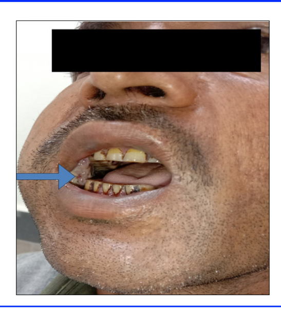
Figure 1. Clinical Photograph Showing Lesion Over the Right Buccal Mucosa (blue arrow) with Restricted Mouth Opening

heterogeneous lesion over the right buccal mucosa with multiple enlarged ipsilateral level Ib, II lymph nodes (Figure 2).