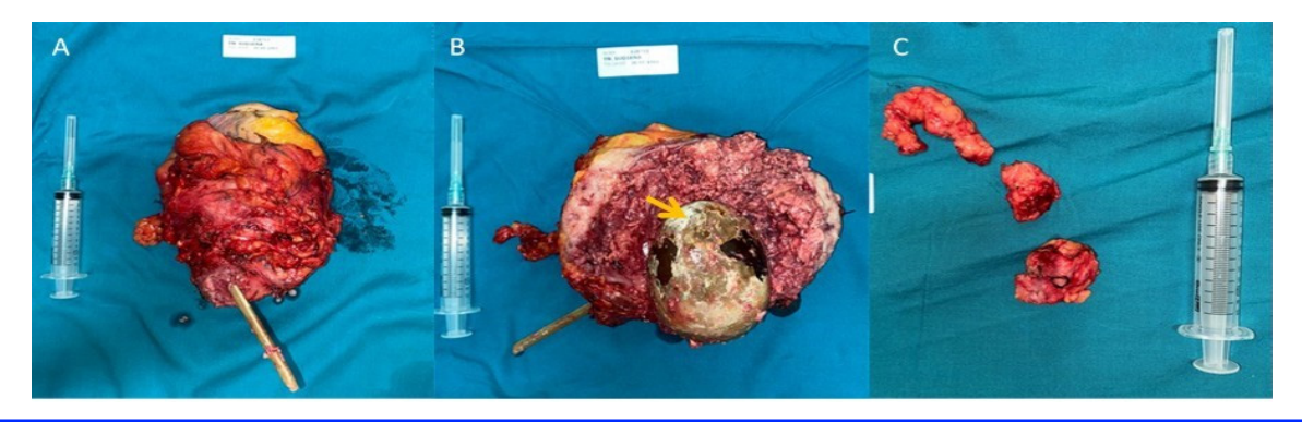
Figure 2. The Specimens were Sent for Histological Investigation Resulting Final Diagnosis of Squamous Cell Bladder Cancer cT4bN1M0