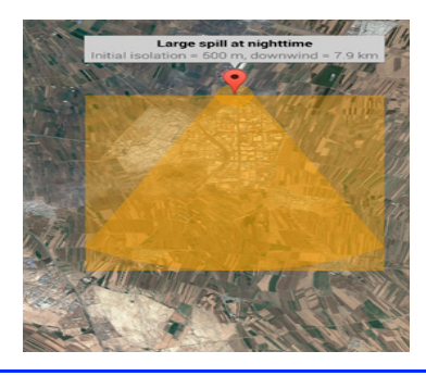
Figure 2. Simulation of Chlorine Gas Leakage from Wells and Water Resources using WISER Software