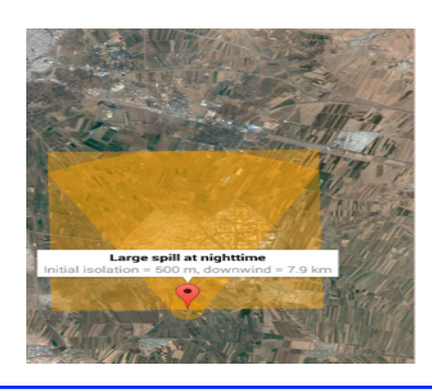
Figure 1. Simulation of Chlorine Gas Leakage from the Treatment Plant Using WISER Software

As mentioned, Alborz Industrial City is bounded from the northwest by the drainage unit of wells and water resources and from the southwest by the drainage unit of the sewage treatment plant. Given that the annual wind direction of May wind in Qazvin province from the north and northwest and the secret wind from the south and southeast (wind percentage 7.12 and speed of 4 m/s is more intense from mid-spring to late summer) [39]. in